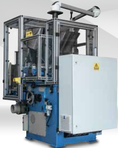
BACK VIEW 45°