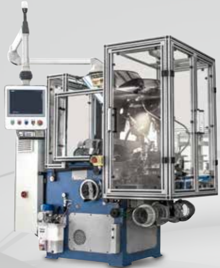
FRONT VIEW 45°