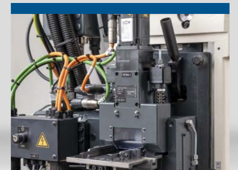
ELECTRONIC ROLLERFEEDER PITCH 90°