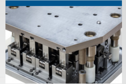
SINGLE EFFECT TOOL VIEW